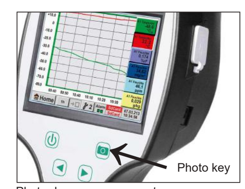
Photo key saves current screen as an image file. No additional software necessary.